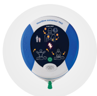
Heartsine 500P RRP $2,695