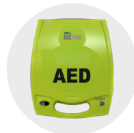
Zoll AED Plus RRP $2,495