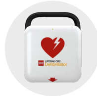
Lifepak CR2 Essential RRP $2,400