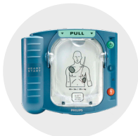
Philips HS1 RRP $2,400