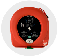
Heartsine 360P RRP $1,995

Automated External Defibrillators (AEDs)