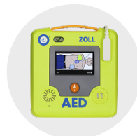
Zoll AED 3 RRP $2,995